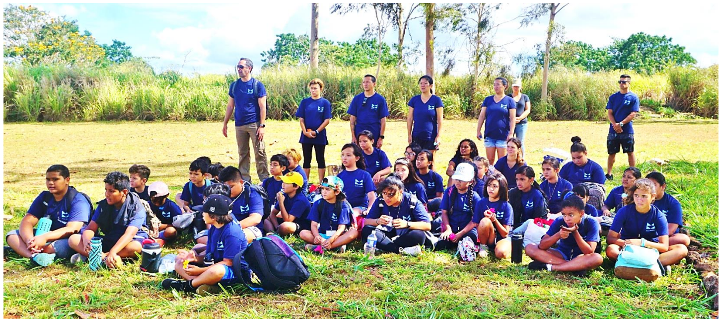
The Estria Foundation Reinventing Spaces, Reinventing People http://estria.org @estria @melemurals

06.21.2k19...Mele Murals Summer program attendees visit. (40) Haumāna ages 9 – 12 years old came to a Piko Listening Journey. Each week of their summer program is designed with different themes. They range from aloha kūpuna, aloha nā ali'i, and aloha la'au. Their huaka'i journey helps them to experience relationship to place. Here they learn visual arts, traditional and cultural Hawaiian practices so they can intertwine them together in their art perception. Learning the sacredness of place, mo'olelo of pohaku and ali'i of Kūkaniloko was the perfect huaka'i today.